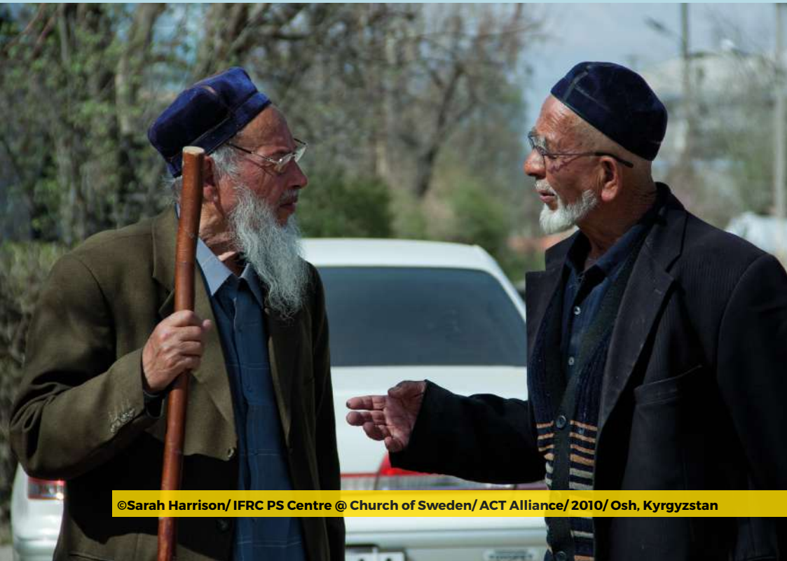
©Sarah Harrison/ IFRC PS Centre @ Church of Sweden/ ACT Alliance/ 2010/ Osh, Kyrgyzstan

During quarantine, where possible, safe communication channels should be provided to reduce loneliness and psychological isolation (e.g. WeChat).